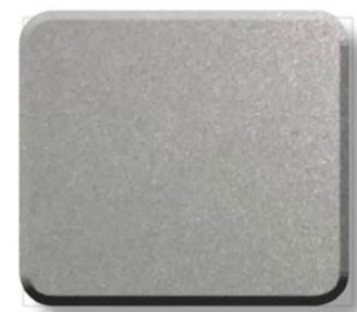
(S) Silver RAL 9006