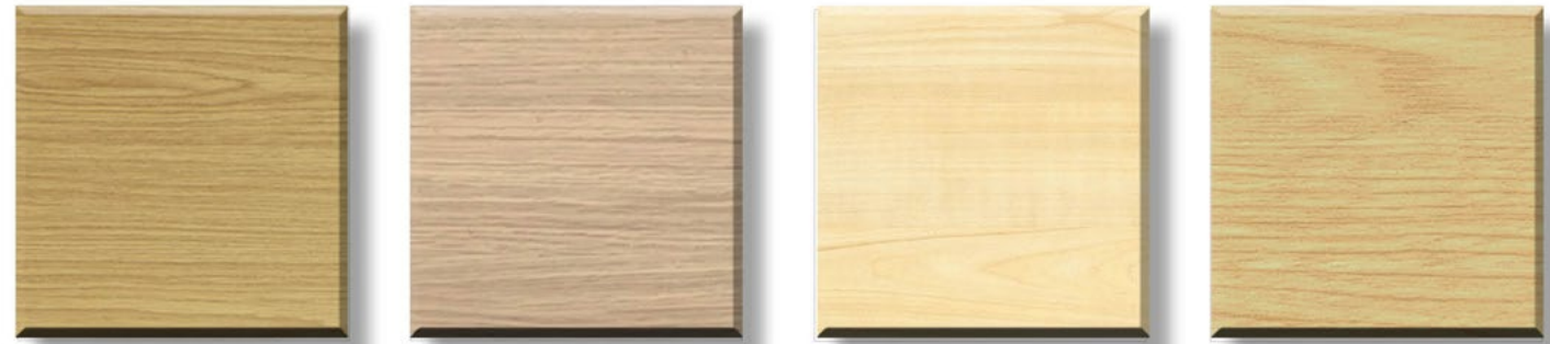
(SO) Stone Oak