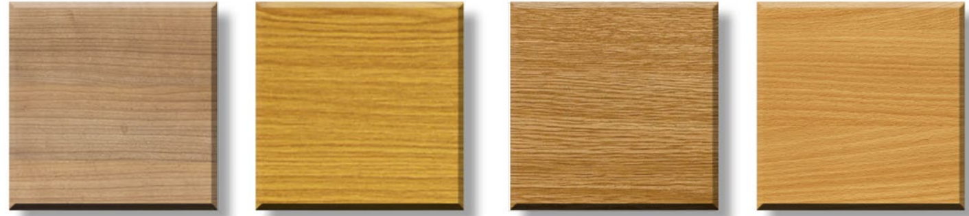
(SC) Santiago Cherry