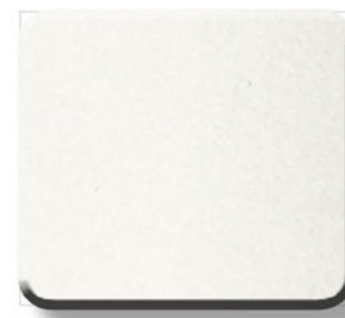
(W) White RAL 9016

All metalwork is epoxy powder coated with a choice of up to 5 finishes as standard.