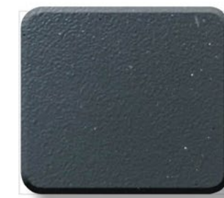
(G) Grey RAL 7012