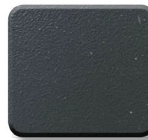
(Qudos Grey) Qudos Graphite Grey RAL 7024 QUDOS ONLY