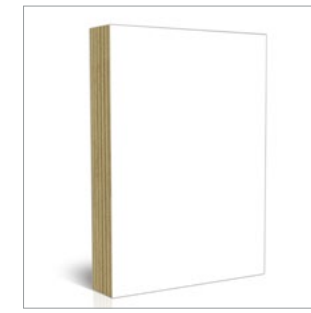
(PLY) Plywood Edging Tape