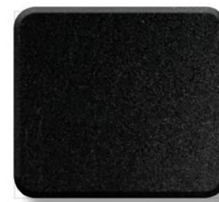
(BL) Black RAL 9017