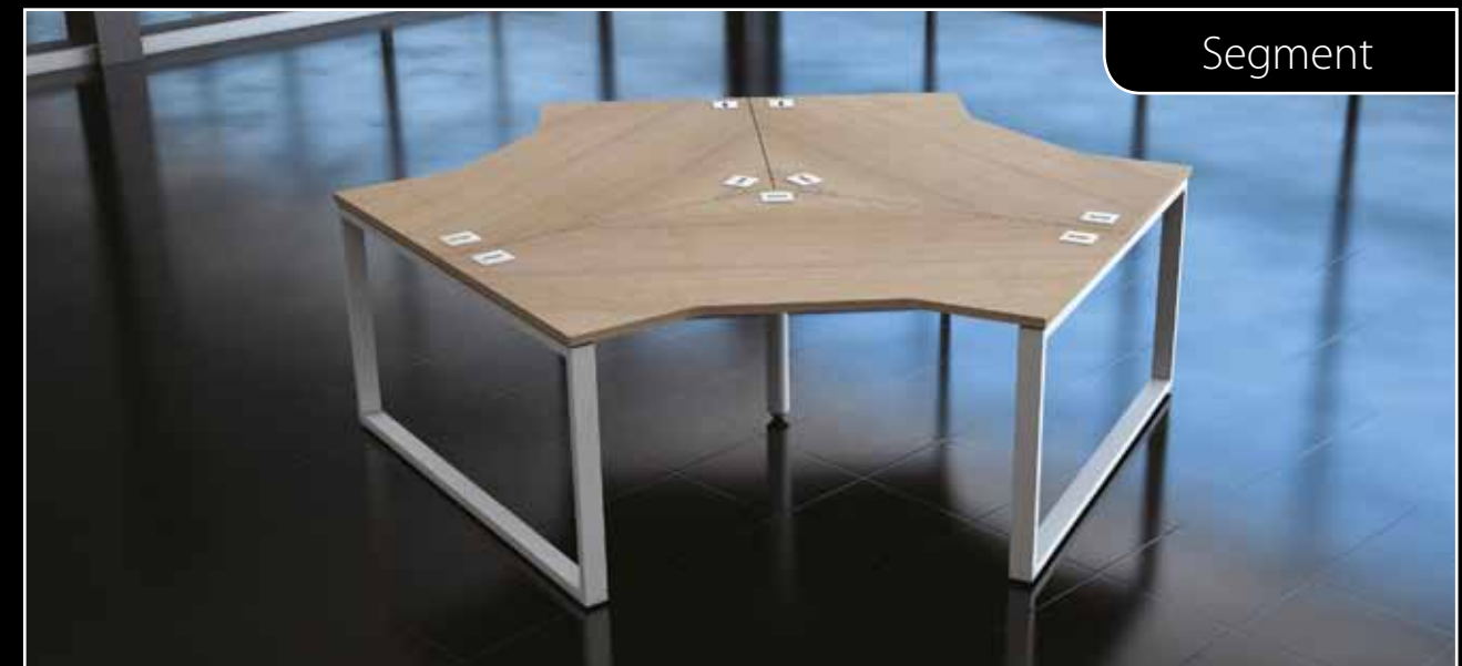
Fixed top shown