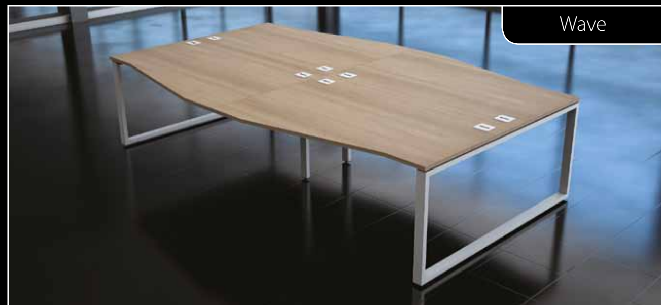
Fixed top shown