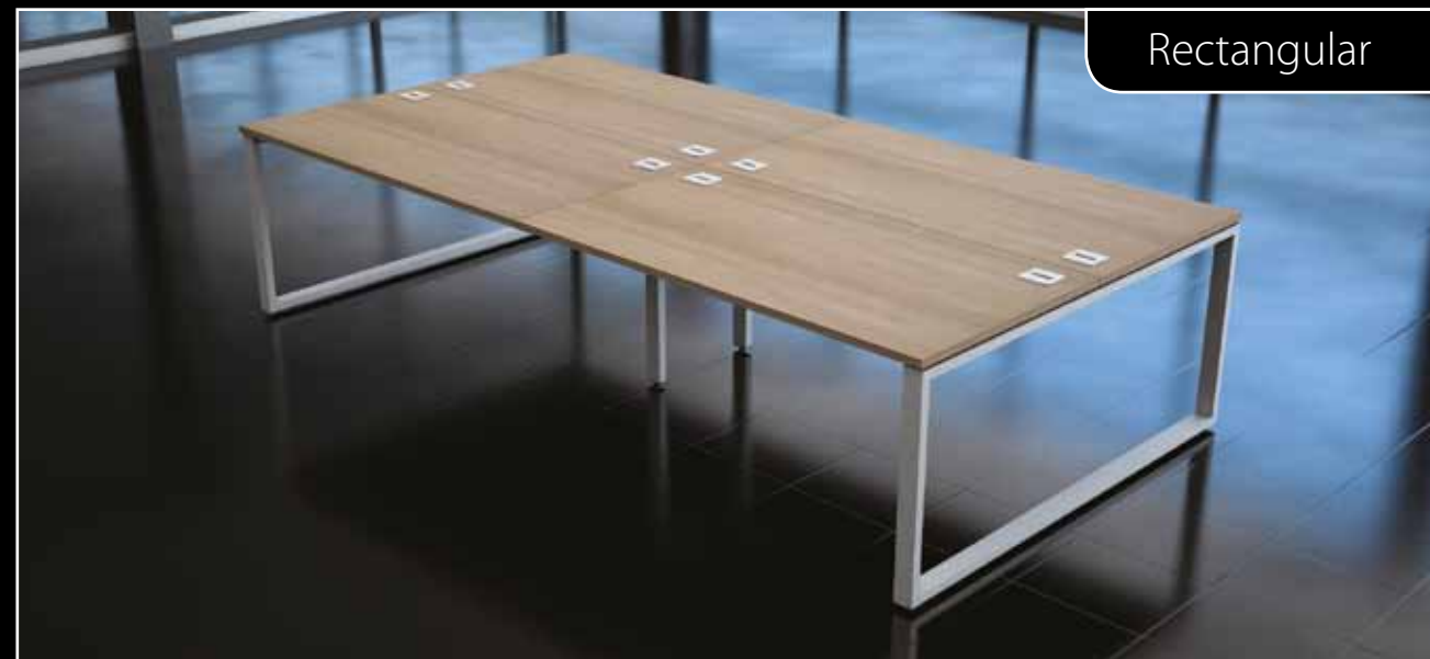
Fixed top shown