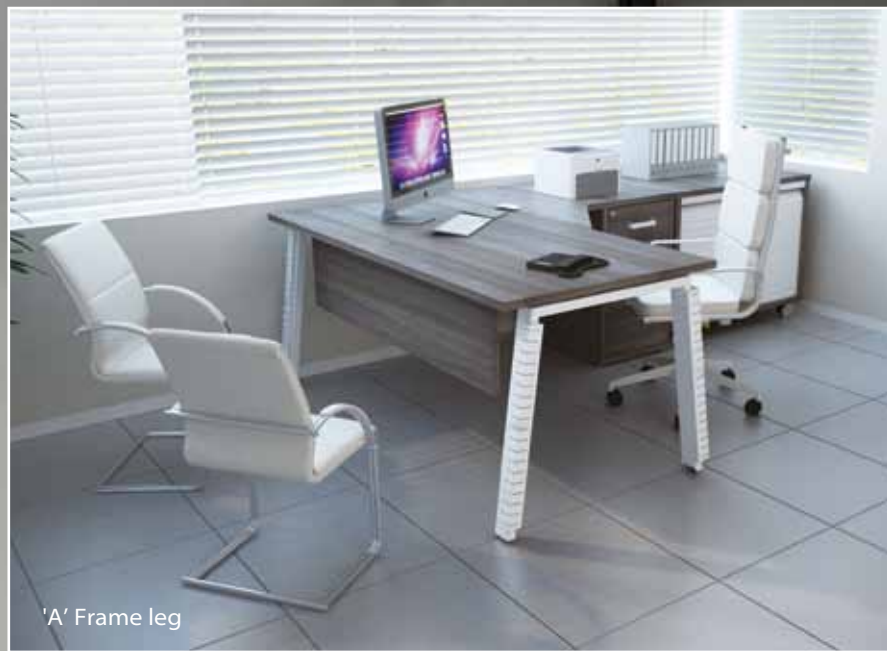
'A' Frame leg