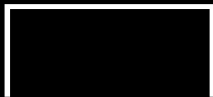
Goal Post leg