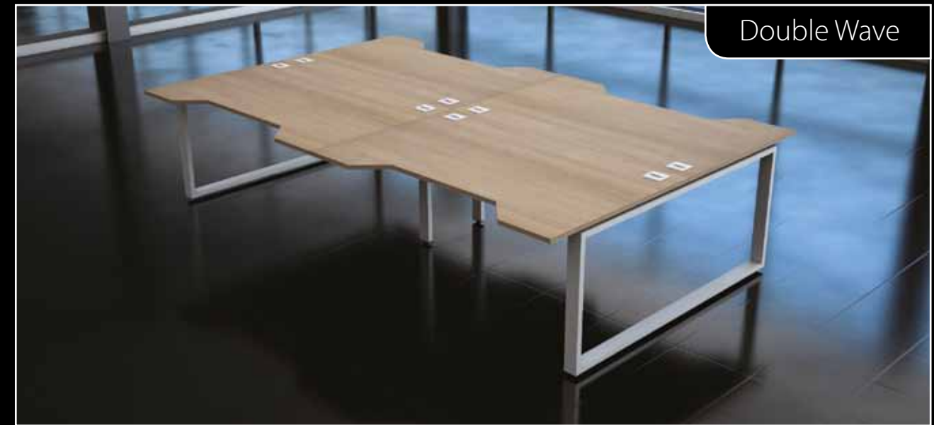
Fixed top shown