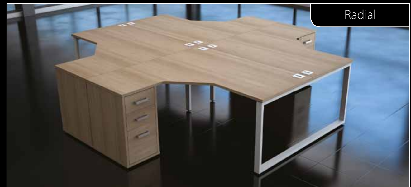
Fixed top shown